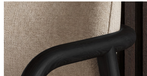
NATURAL OAK / CHARCOAL

Ultra-thin matte lacquer over solid North American oak.