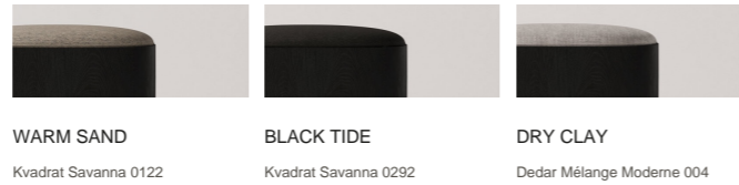
WARM SAND Kvadrat Savanna 0122