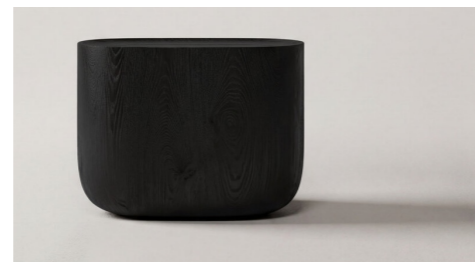
CHARCOAL FINISH Ultra-thin matte lacquer